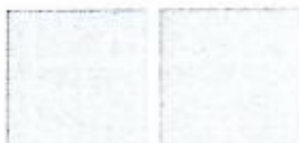
Updated Logo March 31 2020.png 11K