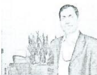
Vijay Kumar.jpg 56K